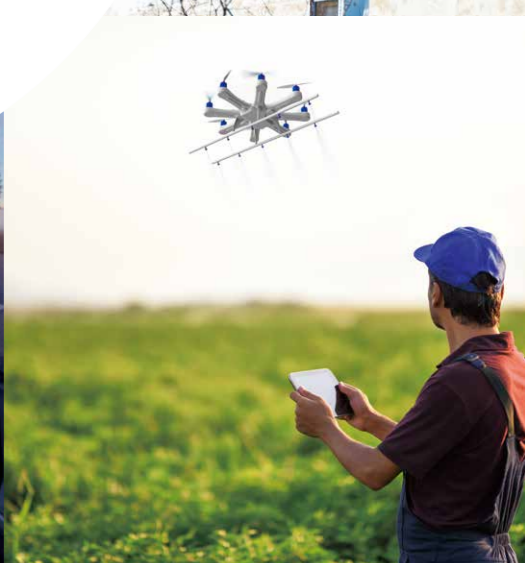
* The photo is for illustrative purposes only.